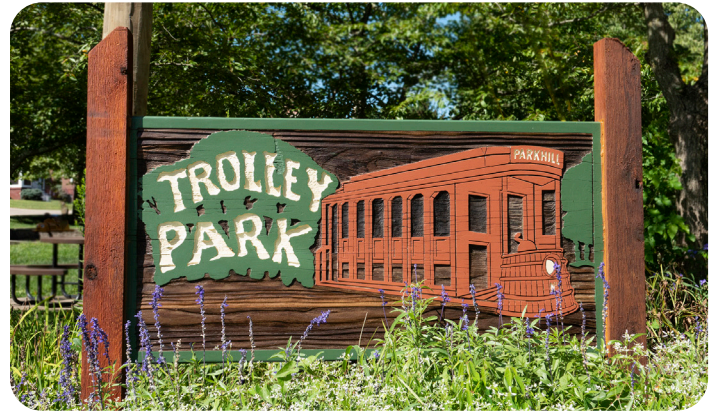
Recent restorations by Ellison Painting