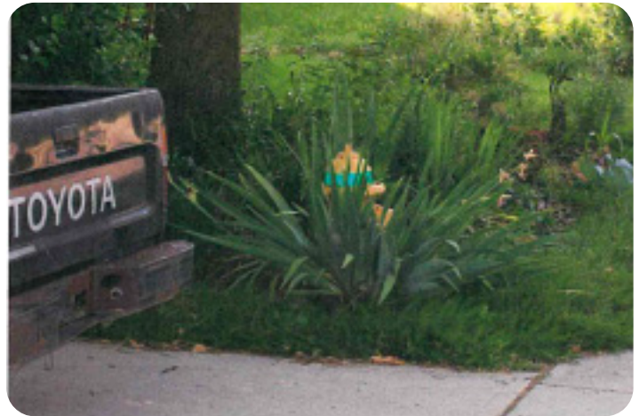
Could you spot this hydrant at 3AM in the rain?

Finding and connecting to a fire hydrant is one of the firefighters' first priorities. New mapping technology on fire vehicles has improved firefighters' ability to find hydrant locations more quickly but getting to them when they are shrouded in shrubs and other vegetation can be a challenge.