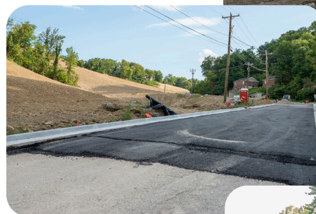
Lower Jackson Reconstruction