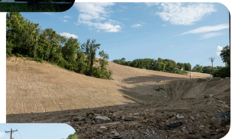
Amsterdam Road Reconstruction