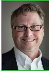
Mayor Matt Mattone

Together, this new budget format and our CIP are vital tools for determining future budgets and tax rates. While this is a significant accomplishment, it's important to note that our revenues continue to grow modestly while our well-managed expenses, continue to steadily rise.