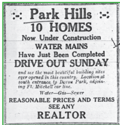
Kentucky Post - 8/9/24

Much like our natural beauty and architectural richness, our history and historic structures have value. Our historic structures have aesthetic and intrinsic economic value while the history of our city has informational value. Taken together, the history of Park Hills and its architectural embodiments are the foundation of the city's identity.