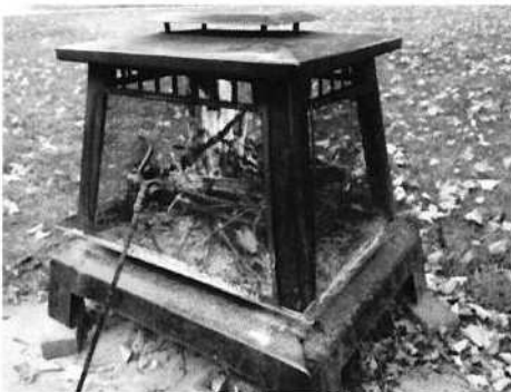
Figure 1 Commercially made Outdoor Fireplace

For additional information please visit www.parkhillfire.com